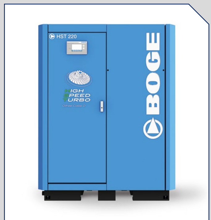
The BOGE High Speed Turbo 220 compressor

There are a number of methods to control the impact that noise from compressed air systems can have on shopfloor workers.